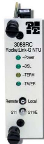
2U-high rack card version available